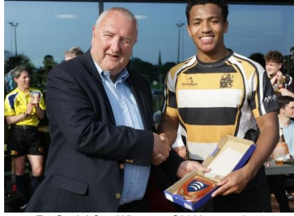
7s: Social Cup Winners: Old Hamptonians