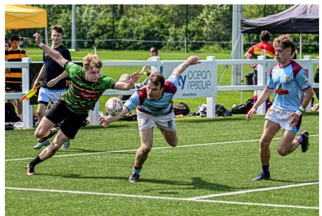
(*) 7s: Grasshoppers II (green) v Chiswick

May was a busy month with Merit Table play offs, Papa John's Cup, county women, girls' U15, men and boys' U17 matches. I watched our men in action against Hertfordshire and Leicestershire. I attended our County Clubs' Dinner and the Middlesex Club Sevens at Grasshoppers RFC, too.