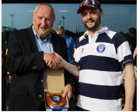
7s: Social Bowl Winners: Actonians RFC