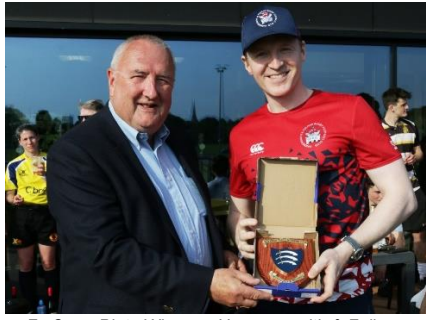
7s Open Plate Winners: Hammersmith & Fulham