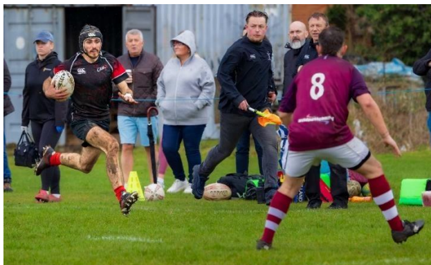
Zuyderhoff attacks for West London.

22 Mar: West London 1 v Ruislip 2. This was a top of the Merit Table clash in Division 2 refereed by James Davies (LSRFUR). The match was won by West London, 11 - 5 pts keeping them the table leader.