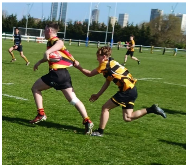
A Wasp (yellow & black hoops) tackles a Sligo player (Yellow, black and red hoops)